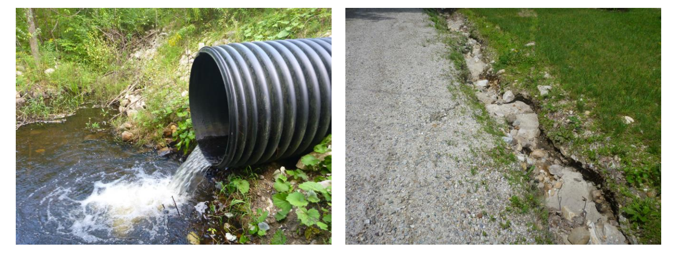
Figure 4: The AOP barrier created by a perched 48" culvert along South Road (left) was the lowest scoring projects (SC-2). The extreme erosion along the edges of Barney Orchard Road (right) was the highest scoring project (RD-8).