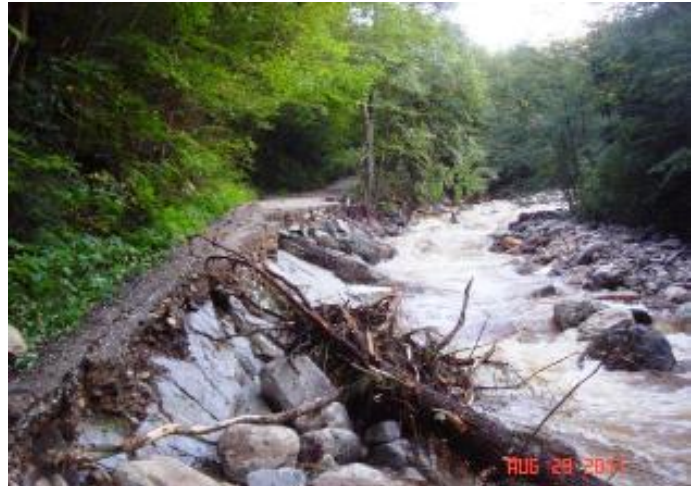
Figure 2: Washout along Kelley Stand Road after Tropical Storm Irene.

Tropical storm Irene (TSI) hit Vermont on August 28<sup>th,</sup> 2011 and dumped 3-5 inches of rain throughout the state with localized areas receiving totals from 7-11 inches. This rainfall coupled with high antecedent soil moisture conditions produced flooding that approached or exceeded the historic flood of 1927 in many large basins. In Sunderland, damage resulting from Tropical Storm Irene was significant, including three houses lost along Kelley Stand Road, which runs parallel to the Roaring Branch (Figure 2).